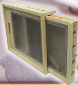
ASIAN HORNET TRAP M01546