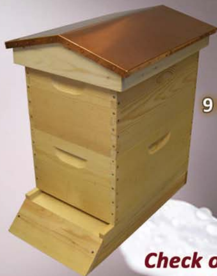
8-FRAME 9 5/8 ASSEMBLED GARDEN HIVE C52901