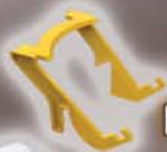
BUCKET BENCH M01380

Check out some of our new products shown below!